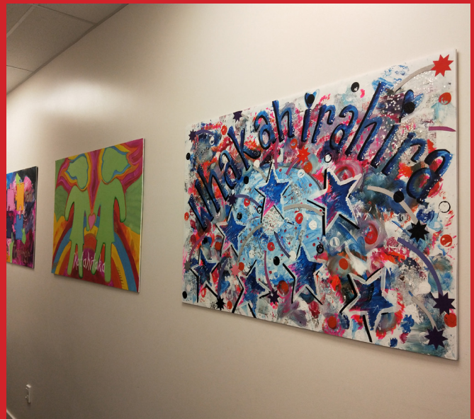
Murals created by St Hilda's students brighten the hallway at our Dunedin office

Christmas gifts for tamariki were donated, we were also grateful to receive a generous $2,000 donation from St Paul's congregation which has provided support towards holiday programmes for tamariki. This support has been particularly critical when all other financial avenues of assistance for struggling whānau had been exhausted.